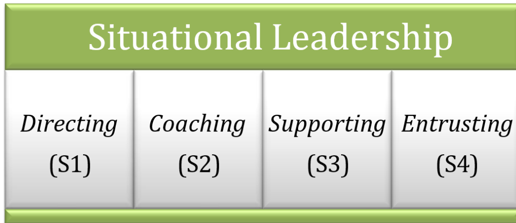
Fig. 2. Stages of Situational Leadership

The success of situational leadership practices is very dependent on the competence of the members of the organization. The better the abilities of organizational members, the greater the possibility of achieving organizational goals.